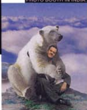
THE STRIPED LOBBY OF THE MARK HOTEL. BELOW: HE SNAPPED THIS PIC IN AN AIRPORT PHOTO BOOTH IN INDIA.