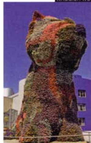
OPPOSITE, TOP LEFT: JEROME MACE; NECKLACE: © TIFFANY & CO.; PALOMA PICASSO, GARDEN: KOONS PUPPY, ELVIS: CORBIS; YSL: © ANDY WARHOL FOUNDATION/ CORBIS; DRINK: GETTY IMAGES; FILM STILL: EVERETT COLLECTION; ABYSS TABLE: DAVID GILL GALLERIES; PICASSO: © 2008 ESTATE OF PABLO PICASSO/ ARTISTS RIGHTS SOCIETY (ARS); NEW YORK: REUNION DES MUSÉES NATIONAUX/ART RESOURCE, NY; WATERCOLOR: JEAN-PHILIPPE DELHOMME; BEDROOM: JASON SCHMIDT; BAR MARK: THE MARK HOTEL; ALL OTHER PHOTOS FROM JACQUES GRANGE.