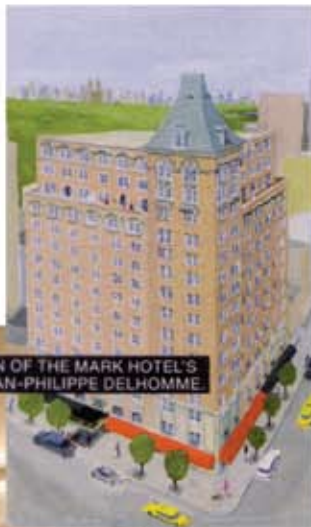
AN ILLUSTRATION OF THE MARK HOTEL'S EXTERIOR BY JEAN-PHILIPPE DELHOMME.